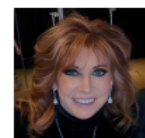
Nancy Lieberman, Basketball Hall of Famer